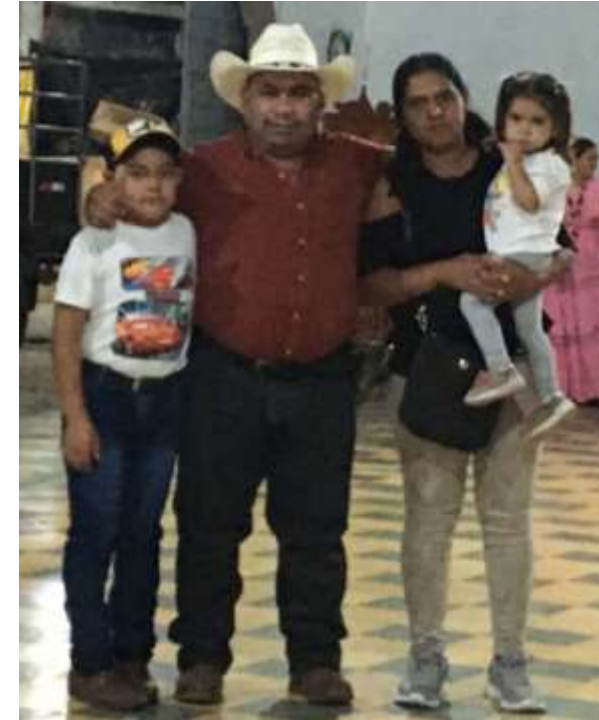
2 years later