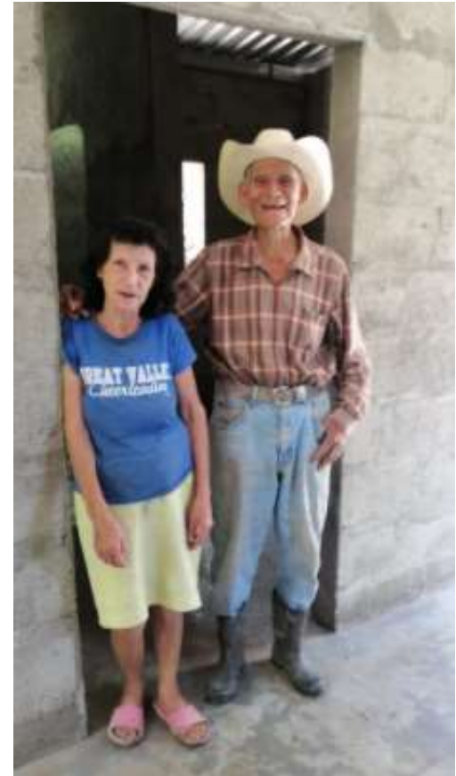
Location: El Modelo Village