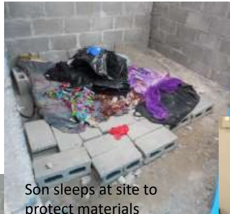
Son sleeps at site to protect materials