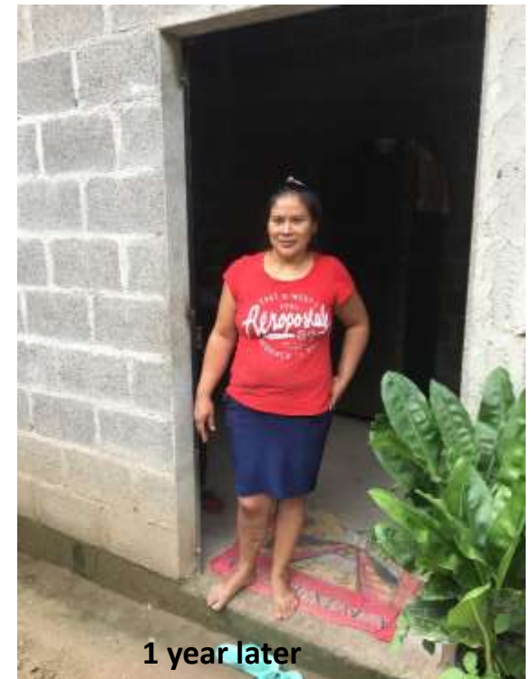
1 year later