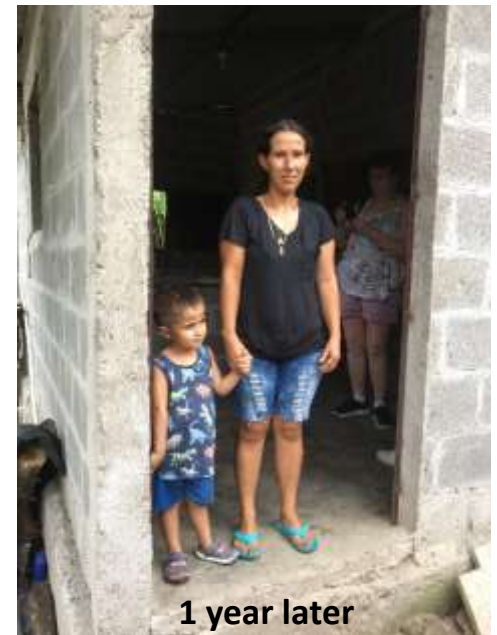
1 year later