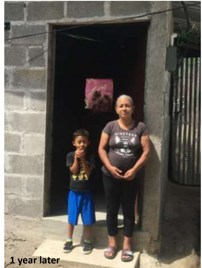
1 year later