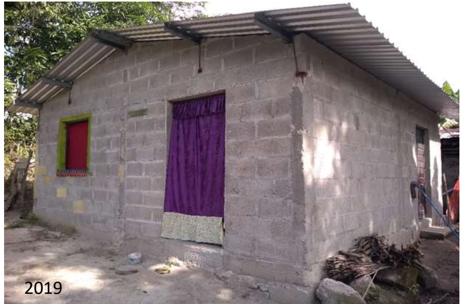
1 year later